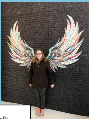
April Mall Walk